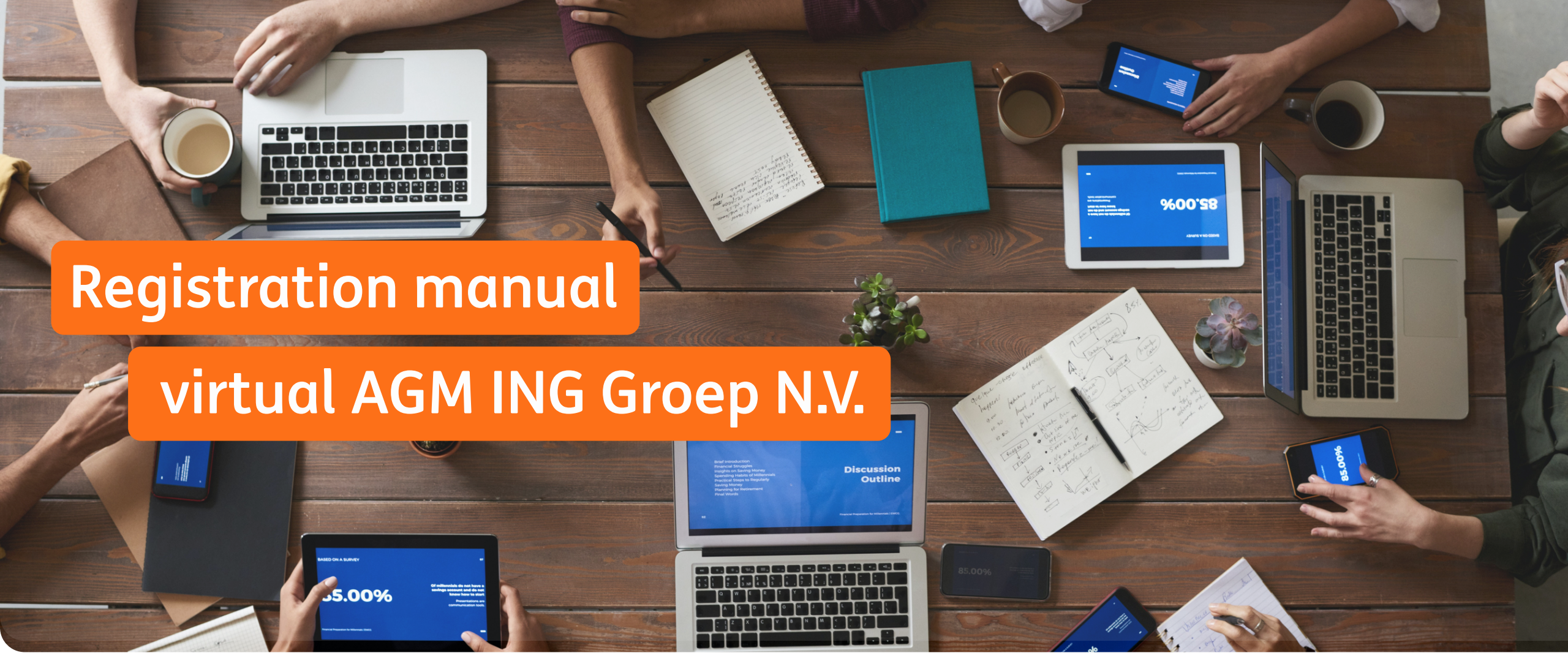
26 April 2021