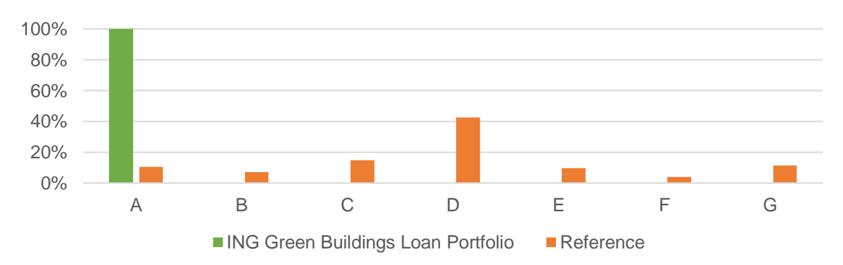
Figure 1: Distribution of energy labels ING Green Buildings Loan Portfolio and Reference

Figure 1 shows the distribution of the energy labels of ING Green Buildings Loan Portfolio and the Reference group. In the ING Green Buildings Loan Portfolio, 89% of the objects have a definitive energy label. The other 11% has a calculated energy label, based on the construction year. All objects in the ING Green Buildings Loan Portfolio have an energy label A. The top 10% of the Reference has an energy label A. Therefore buildings in the ING Green Buildings Loan Portfolio belong to the top 10% most energy efficient buildings of the Dutch real estate market.